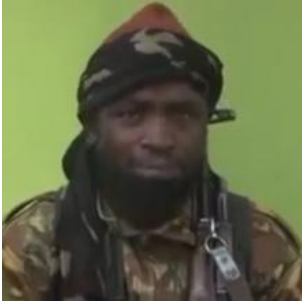
Abubakar Shekau Leader (deceased)