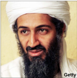
Osama bin Laden

De facto leader (reported), senior leader, member of the majlis al- shura leadership council