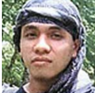
Khadaffy Abubakar Janjalani

Former emir and senior leader, confirmed dead