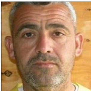
Abu Muslim al-Turkmani Former deputy of ISIS-controlled Iraq - deceased