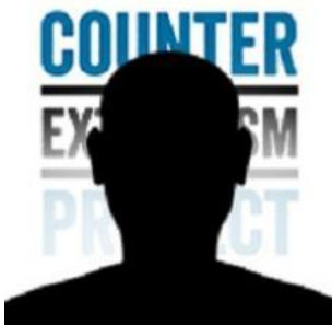
Abu Hafs al-Hashimi al-Qurayshi Caliph