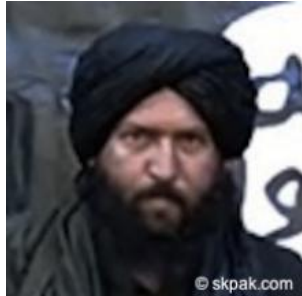
Hafiz Saeed Khan Former emir in AfPak - deceased