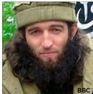
Rustam Aselderov Former leader in the Caucasus - deceased