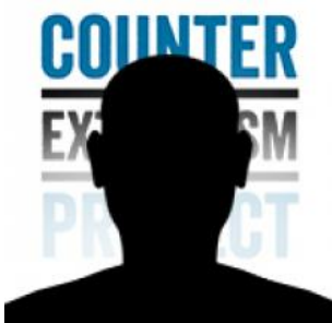
Wael Adel Salman al-Fayad Former minister of information - deceased