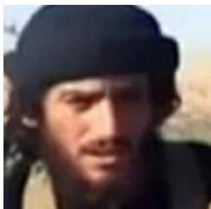
Abu Muhammad al-Adnani

Former spokesman, emir of ISIS in Syria, and head of ISIS's Emni unit - deceased