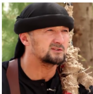
Gulmurod Khalimov Minister of war - deceased