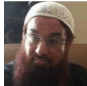
Abu Sufyan Bin Qumu