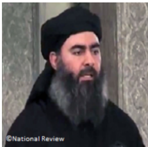
Abu Bakr al-Baghdadi Caliph - deceased