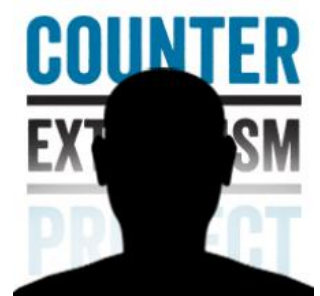
Abu Bilal al-Harbi Emir in Yemen