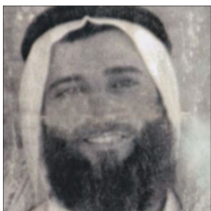
Abu Suleiman al-Naser Former minister of war - deceased