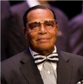
Louis Farrakhan Leader