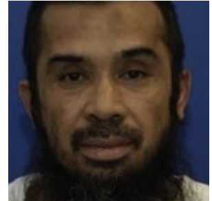
Riduan Isamuddin (a.k.a. Hambali) Operational leader, head of regional shura, suspected al-Qaeda operations director for East Asia, now in extrajudicial detention at Guantanamo Bay