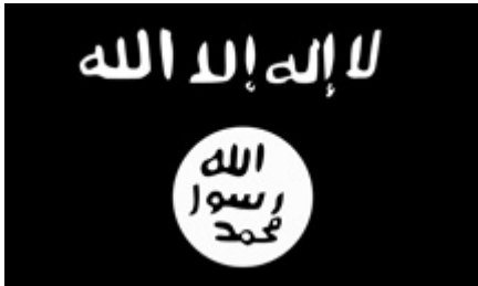
Abu Sayyaf Group (ASG)