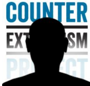
Abdullah Sungkar Founder and former spiritual leader, deceased