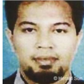
Noordin Top Top recruiter, one of the masterminds behind the August 2003 attack on Marriott Hotel and September 2004 car bomb outside Australian Embassy in Jakarta, reportedly killed by Indonesian police in Java on September 17, 2009