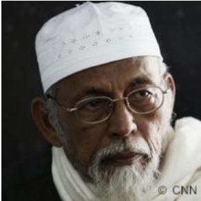
Abu Bakar Bashir Founder and spiritual leader, alleged operational leader