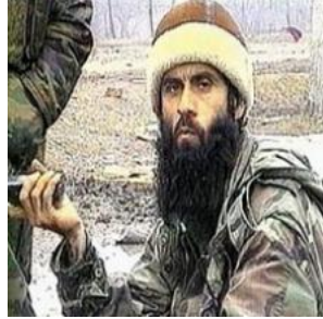
Juma Namangani Cofounder, Emir (deceased)