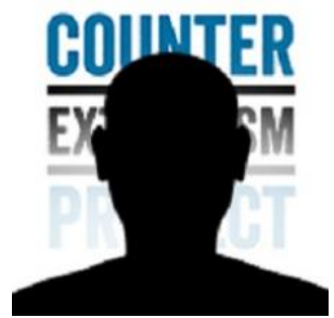
Abbas Mansour Military commander (deceased)