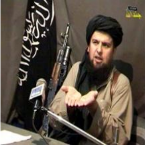
Tahir Yuldashev Cofounder, Emir (deceased)