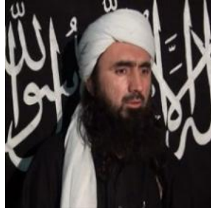
Usman Ghazi Emir, former deputy Emir (deceased)