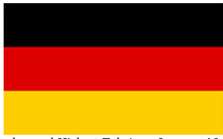
Germany banned Hizb ut-Tahrir on January 10, 2003.<sup>184</sup>