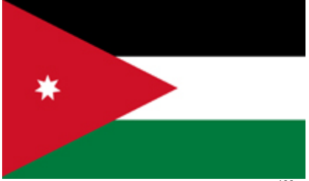
Jordan has banned Hizb ut-Tahrir. 186