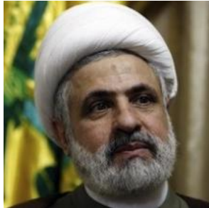
Naim Qassem Deputy Secretary-General