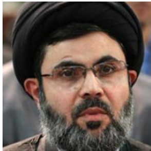
Hashem Safieddine Head of Executive Assembly