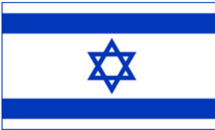
Israel—listed Hezbollah as a terrorist organization on April 11, 1996. 306