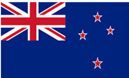
New Zealand—listed Hezbollah as a terrorist organization on February 10, 2010. 314