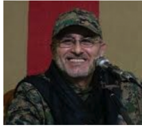
Mustafa Badreddine Military Commander (deceased)