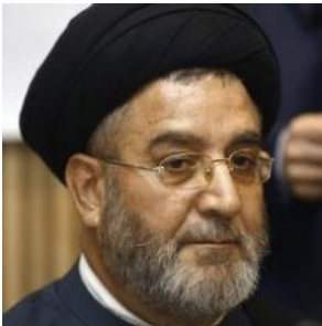
Ibrahim Amin al-Sayyid Head of Political Assembly