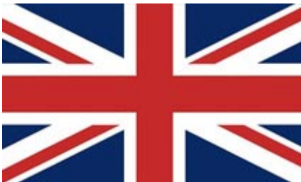
United Kingdom—banned Hezbollah's External Security Organization on February 11, 2001, and designated its military wing as a terrorist organization in 2008. The United Kingdom designated Hezbollah in its entirety as a terrorist organization in March 2019. On January 16, 2020, the United Kingdom added Hezbollah in its entirety to its Consolidated List of Financial Sanctions Targets. Hezbollah's military wing remains separately sanctioned per the European Union's separate listing. 308