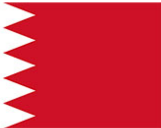
Bahrain—listed Hezbollah as a terrorist organization on April 9, 2013. 312