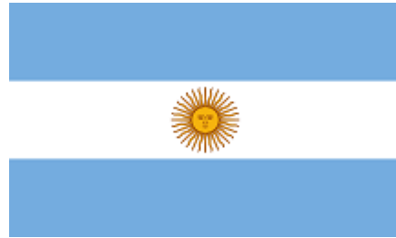
Argentina—designated Hezbollah as a terrorist organization on July 18, 2019. 323