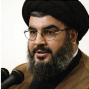
Hassan Nasrallah Secretary-General