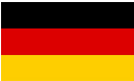
Germany—banned al-Manar on October 29, 2008. 316 Germany banned Hezbollah's military wing in 2013. 317 Germany designated Hezbollah in its entirety as a terrorist organization on April 30, 2020. 318