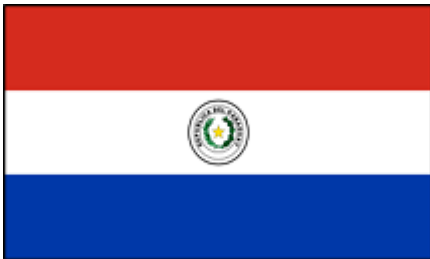
Paraguay—designated Hezbollah as a terrorist organization on August 19, 2019. 324