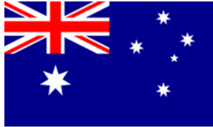
Australia—listed Hezbollah's External Security Organization as a terrorist organization on June 5, 2003. 311