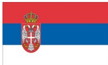
Serbia—agreed to designate Hezbollah in its entirety as a terrorist organization on September 13, 2020. 329