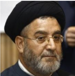
Ibrahim Amin al-Sayyid Head of Political Assembly