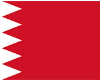
Bahrain—listed Hezbollah as a terrorist organization on April 9, 2013. 303