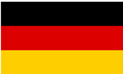
Germany—banned al-Manar on October 29, 2008. 307 Germany banned Hezbollah's military wing in 2013. 308 Germany designated Hezbollah in its entirety as a terrorist organization on April 30, 2020. 309