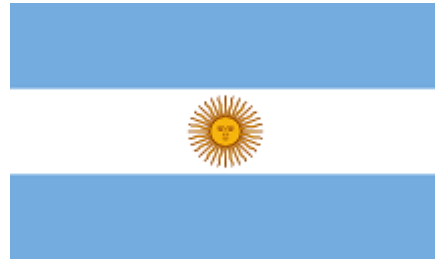
Argentina—designated Hezbollah as a terrorist organization on July 18, 2019. 314