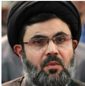
Hashem Safieddine Head of Executive Assembly