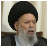
Mohammad Hussein Fadlallah, February 1992 [485]

"Israel will not escape vengeance... there would be much more violence and much more blood would flow." 485