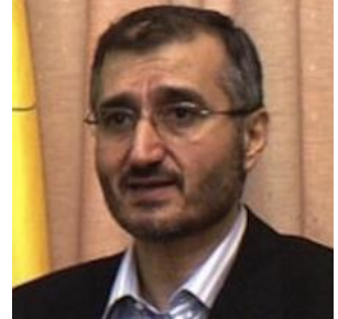
Hussein al-Khalil Top Political Adviser to Nasrallah