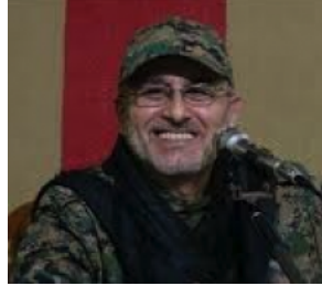
Mustafa Badreddine Military Commander (deceased)