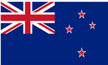
New Zealand—listed Hezbollah as a terrorist organization on February 10, 2010. 305