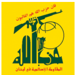
Hezbollah Manifesto, 1985 [486]