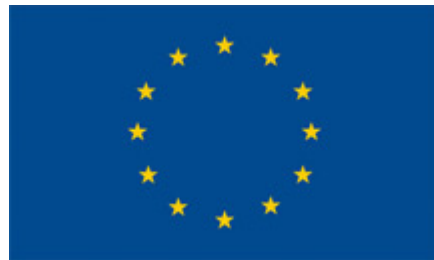
European Union—listed the Hezbollah Military Wing as a terrorist organization on July 22, 2013. 298