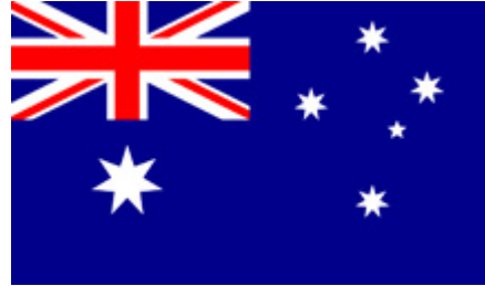
Australia—listed Hezbollah's External Security Organization as a terrorist organization on June 5, 2003. 302