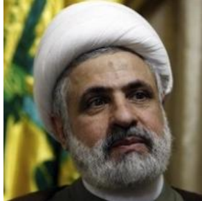
Naim Qassem Deputy Secretary-General