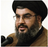
Hassan Nasrallah, 2002 [484]

"If they (Jews) all gather in Israel, it will save us the trouble of going after them worldwide." 484