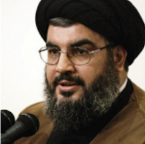
Hassan Nasrallah Secretary-General