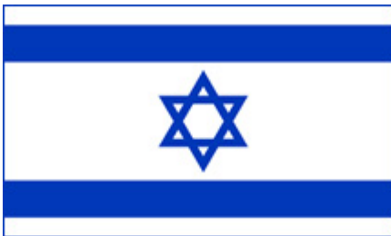
Israel—listed Hezbollah as a terrorist organization on April 11, 1996. 297