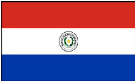
Paraguay—designated Hezbollah as a terrorist organization on August 19, 2019. 315