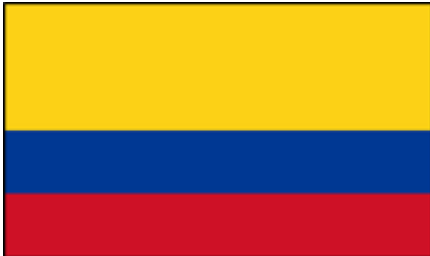
Colombia—designated Hezbollah as a terrorist organization in January 2020. 317