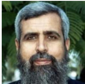
Salah Shehadeh Founder of the Qassam Brigades - deceased