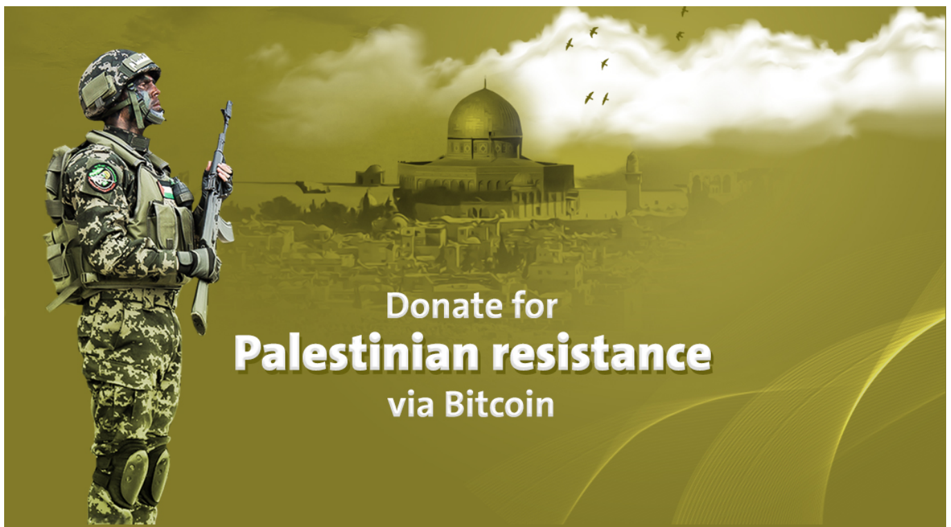
Screenshot of the Qassam Brigades website. August 20, 2019.

Hamas seeks to bypass international financial sanctions through the use of cryptocurrencies, the movement of which is harder to trace than traditional currencies. 73 The Qassam Brigades website provides an animated instructional video on how to create a Bitcoin wallet—the decentralized digital method of storing Bitcoins—and make an anonymous donation to Hamas that cannot be traced by authorities. The site is available in multiple languages, including English, Arabic, French, and Russian. 74 To further avoid detection, Hamas’s website generates links to individual Bitcoin wallets—making each transaction unique—on its site instead of using a cryptocurrency exchange, which can be more easily tracked by authorities. 75