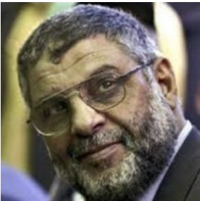
Abdel Azziz al-Rantisi Co-founder of Hamas - deceased