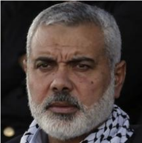
Ismail Haniyeh Chief of Political Bureau, former deputy leader of Hamas, Hamas's former prime minister of Gaza, former prime minister of the Palestinian Authority