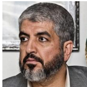
Khaled Meshaal Chief chairman of Hamas's political bureau