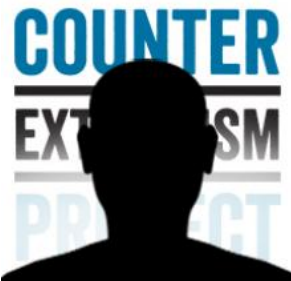
Marwan Issa High-ranking leader of the Izz ad-Din al-Qassam Brigades