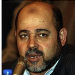
Mousa Abu Marzouk Deputy political bureau chief and fundraiser