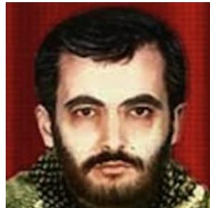
Yehya Ayyash Bombmaker and former leader of the Izz ad-Din al-Qassam Brigades - deceased