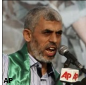
Yahya Sinwar Leader of the Gaza Strip Political Bureau for Hamas