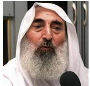
Ahmed Yassin Co-founder of Hamas - deceased