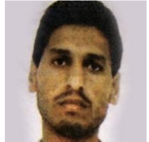
Mohammed Deif Chief leader and commander of the Izz ad-Din al-Qassam Brigades