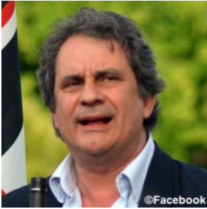
Roberto Fiore Leader, former member of European parliament