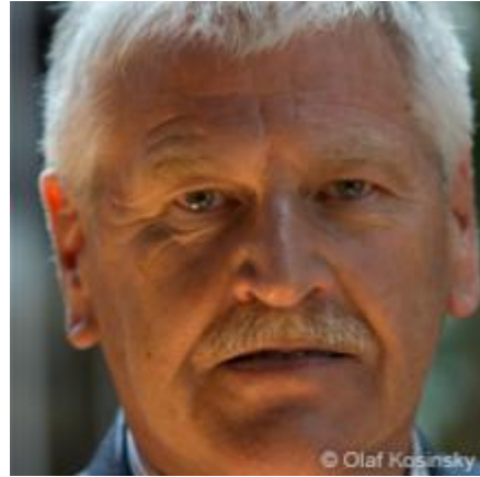
Udo Voigt [80]