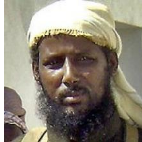
Mukhtar Robow Former deputy emir