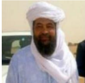
Iyad Ag Ghali JNIM emir (leader)