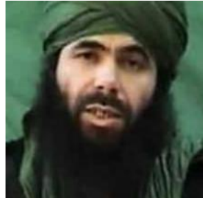
Abdelmalek Droukdel Former AQIM emir (leader), in charge of Algeria (deceased)