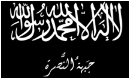
Nusra Front [158]

AQIM has declared its support for the al-Qaeda affiliate in Syria. As AQIM's head of media stated in 2013, "The stance of AQIM from the Jihadi groups like Jabhat Al-Nusra and Ahrar Al-Sham Brigades and the other Jihad groups is alliance and support." 170