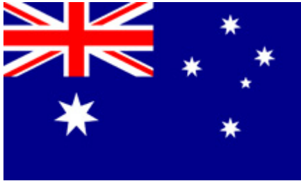
Australia—listed GSPC as a terrorist organization on November 14, 2002. 146