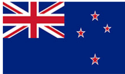
New Zealand—listed GSPC as a terrorist organization on October 17, 2002. 149