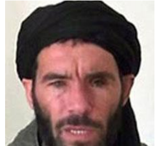
Mokhtar Belmokhtar Al-Mourabitoun emir, co-founder