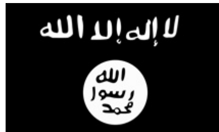
Al-Qaeda in the Arabian Peninsula (AQAP) [157]

AQIM clarified its ties to al-Qaeda when AQIM leader Abdelmalek Droukdel said in 2008, “We [AQIM] and Al Qaeda are one body. It’s normal that they get stronger by us and we get stronger by them. They back us up and we back them up. They supply us and we supply them with any kind of support, loyalty, advice and available support.” 155