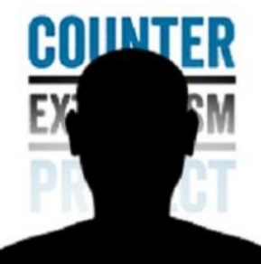
Zakir Musa Chief of Kashmir Affiliate Ansar Ghazwat ul Hind (deceased)