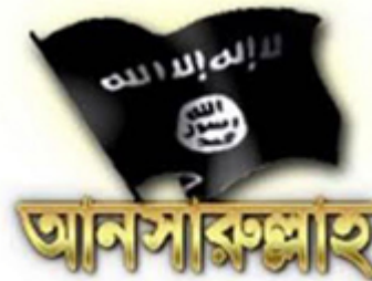
Ansarullah Bangla Team