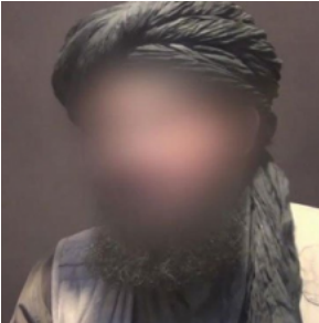
Asim Umar AQIS emir (leader) (deceased)