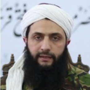
Abu Muhammad al-Golani Leader, overall leader of HTS coalition