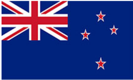
New Zealand—listed al-Nusra Front as an organization associated with Al-Qaeda on May 15, 2013. 367