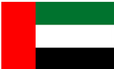
The United Arab Emirates—listed al-Nusra Front as a terrorist organization on November 15, 2014. 371