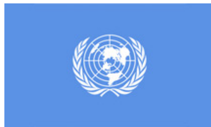
United Nations—listed al-Nusra Front as an entity associated with Al-Qaeda on May 30, 2013. 372