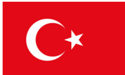
Turkey—listed al-Nusra Front as a terrorist organization on June 13, 2014. 370