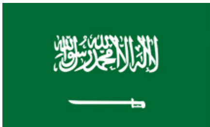
Saudi Arabia—listed al-Nusra Front as a terrorist group on March 7, 2014. 369