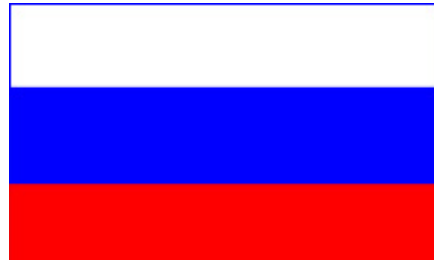
Russia—listed al-Nusra Front as a terrorist group on December 29, 2014. 368