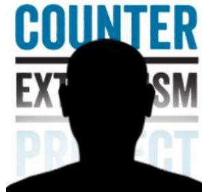
Abu 'Abdallah al-Shami' Top sharia official of HTS