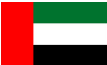
The United Arab Emirates—listed al-Nusra Front as a terrorist organization on November 15, 2014. 369