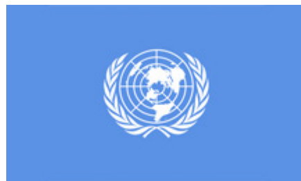
United Nations—listed al-Nusra Front as an entity associated with Al-Qaeda on May 30, 2013. 370