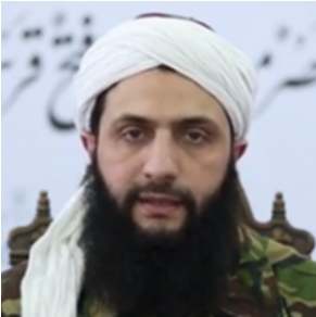
Abu Muhammad al-Golani Leader, overall leader of HTS coalition