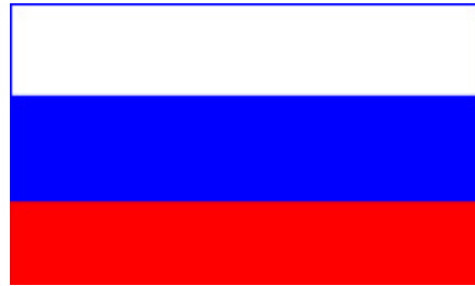
Russia—listed al-Nusra Front as a terrorist group on December 29, 2014. 366