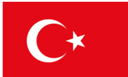
Turkey—listed al-Nusra Front as a terrorist organization on June 13, 2014. 368