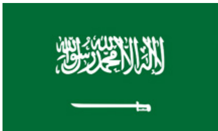
Saudi Arabia—listed al-Nusra Front as a terrorist group on March 7, 2014. 367