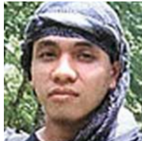
Khadaffy Abubakar Janjalani Former emir and senior leader, confirmed dead