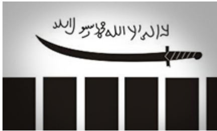
Jemaah Islamiyah (JI) [124]

ASG provided a special training camp to JI militants in its stronghold of southern Mindanao. JI militants intermingled with ASG during this time, training together on subjects such as bomb making. 184 ASG has also been known to harbor JI militants in its dense jungle landscape. In March 2010, the Indonesian government formally requested that Philippine law enforcement track down an Indonesian national and JI trainer of the MILF and ASG known only as Sanusi. Sanusi allegedly perpetrated sectarian violence in the Sulawesi region of Indonesia, including the beheadings of three school girls in 2007. 185