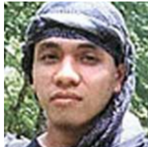
Khadaffiy Abubakar Janjalani Former emir and senior leader, confirmed dead