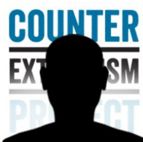
Abdurajak Abubakar Janjalani Founder and former emir, confirmed dead