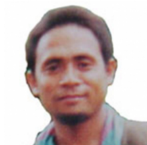
Isnilon Totoni Hapilon Leader of Basilan faction and alleged ISIS leader in Southeast Asia (deceased)