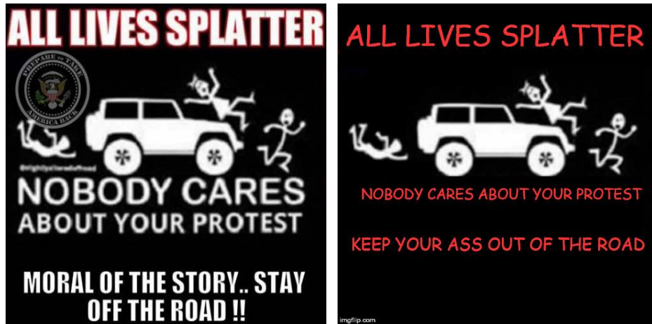
"All Lives Splatter" meme mimic the slogan Black Lives Matter.