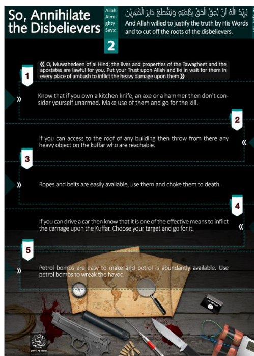
The English-language, pro-ISIS online magazine Voice of Hind called for vehicular attacks in April 2020.

Following the wave of vehicular terrorist attacks in 2016 and 2017, ISIS has continued to issue calls to violence and warnings of additional car-ramming attacks. On May 17, 2017, the group released a video threatening attacks in the United Kingdom, Europe, and the United States, especially in New York, Las Vegas, and Washington, D.C. ISIS has also threatened and encouraged vehicular attacks on gay pride parades. 46 In June 2017, an account operating under the name of ISIS’s Nashir agency released a renewed call for ISIS supporters to “[r]un over people by vehicles and [c]ut off their necks in any time [sic].” 47 In April 2020, the third issue of pro-ISIS online magazine Sawt al-Hind (Voice of India) issued a new call for vehicular attacks as one of multiple inexpensive and easy ways to attack non-believers. 48