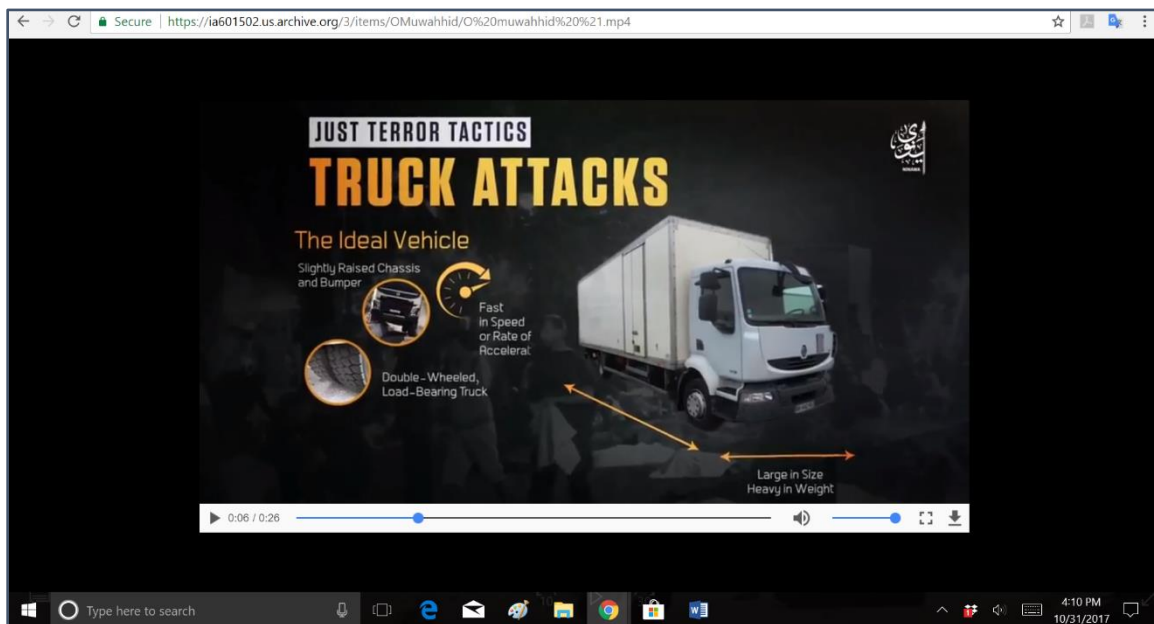
A 26-second video clip on truck attacks available on the Internet Archive, taken from the longer ISIS video “We Will Surely Guide Them to Our Ways,” (originally released May 17, 2017). CEP located the clip October 31, 2017.