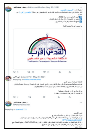
See translation of essential elements of this interaction in footnote 33.

In 2022, the United Nations described the telecommunications industry in Yemen as "a major source of revenue for the Houthi authorities." The question of exactly how much money the Houthis have skimmed off Yemen Mobile's revenues remains difficult to answer. However, it is clear based on publicly available information that the number is at least tens of millions of dollars, when taking into account the massive hikes in "licensing fees" and the newly instituted "Zakat tax." And while tens of millions of dollars may not seem like much for a national government, it is indeed a very significant amount of money in Yemen where the GDP per capita is below $700.28