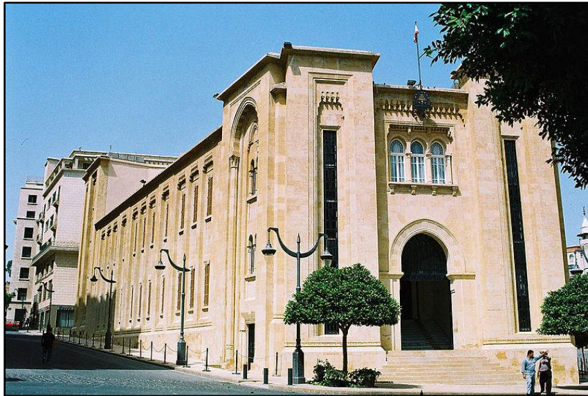
The Lebanese Parliament in Beirut.