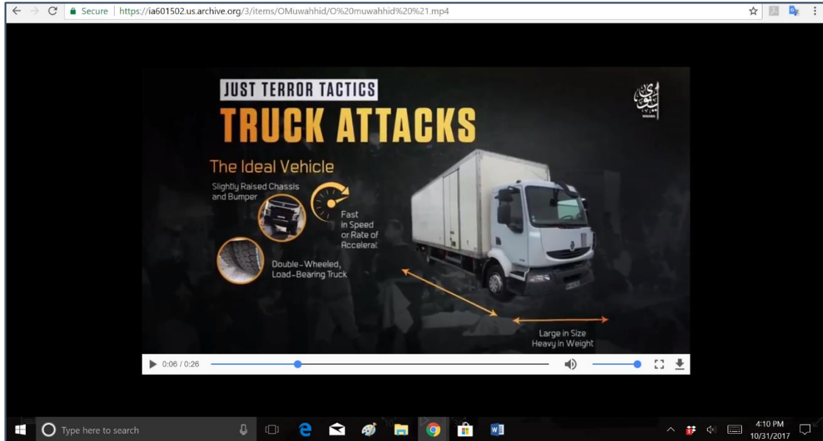
A 26-second video clip on truck attacks available on the Internet Archive, taken from the longer ISIS video “We Will Surely Guide Them to Our Ways,” (originally released May 17, 2017). CEP located the clip October 31, 2017.

In September 2014, ISIS spokesman Abu Muhammad al-Adnani issued a call to kill non-believers using any means at their disposal. “[S]ingle out the disbelieving American, Frenchman, or any of his allies,” he said. “Smash his head with a rock, or slaughter him with a knife, or run him over with your car.” 43 In November of that year, French foreign fighter Abu Salman al-Faranci appeared in a video reiterating ISIS’s call for followers—particularly in France—to carry out domestic attacks if they could not join ISIS abroad. As Faranci said to his viewers: “Terrorize them and do not allow them to sleep due to fear and horror. There are weapons and cars available and targets ready to be hit.” 44