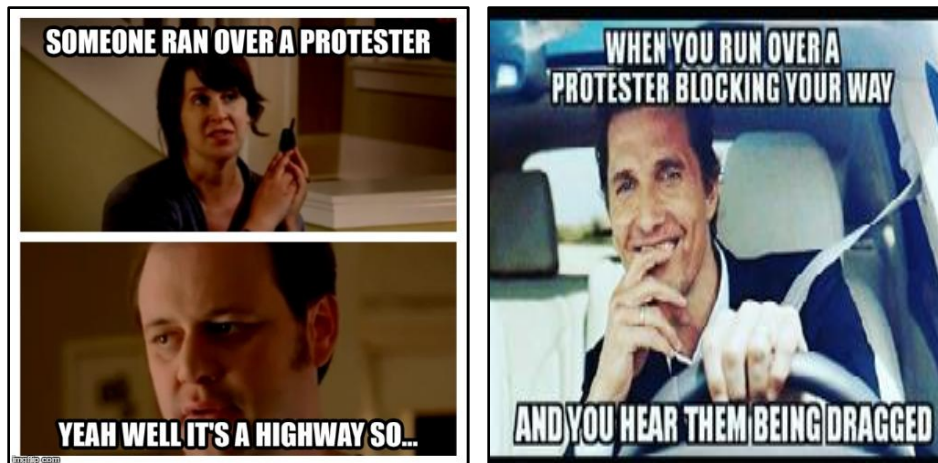
Another set of memes glorifies vehicular attacks against protesters through the delegitimization of protesters’ lives. These memes portray the message that they deserve to be victims of violence for demonstrating on streets and highways.

These memes not only delegitimize the reasons behind the protests, they broadly encourage violence against protesters by characterizing them as inconveniences. Thus, whether the protesters are demonstrating for racial justice, the environment, or any other cause becomes inconsequential. These memes shift the focus from the specific cause to the objectification of the protesters themselves.