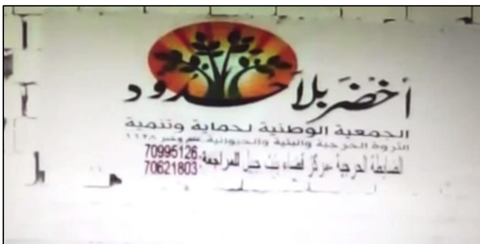
Hezbollah has allegedly disguised spy outposts along the Lebanese-Israeli border as outposts of an environmental NGO called Green Without Borders.

Hezbollah has also allegedly used NGOs and their causes to disguise its own militant activities. In June 2017, the Israeli army revealed video of Hezbollah surveillance outposts along the Lebanese-Israeli border. The outposts were disguised as field offices of a purported environmental NGO called Green Without Borders. Hezbollah had been flying the NGO's banner over the outposts since at least April 2017, according to the army. 197 UNIFIL inspectors were reportedly turned away from one of the outposts that April. 198 A Lebanese NGO called Green Without Borders has been active in the country since at least 2014. 199