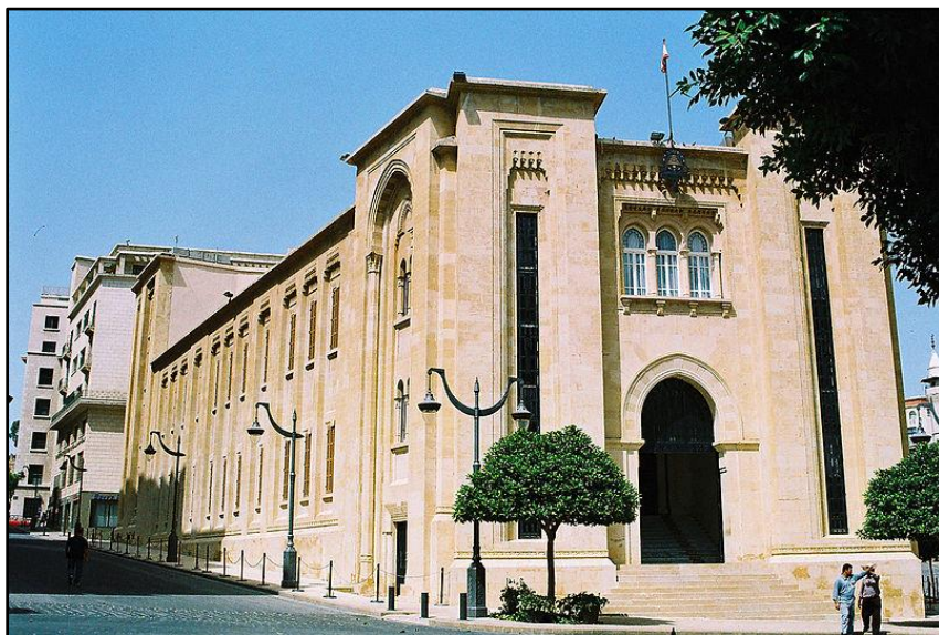
The Lebanese Parliament in Beirut.