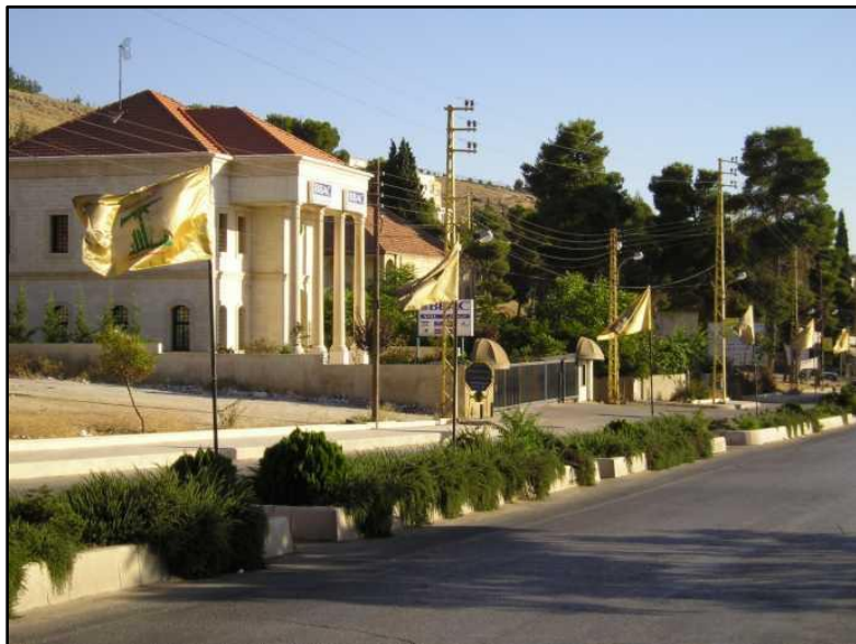
Hezbollah flags line the streets of Baalbek, Lebanon.

Hezbollah has for years been a fixture in Lebanese governing coalitions, first entering Lebanon's parliament in 1992, when it won eight of 128 seats in the country's first elections since 1972. 88 Hezbollah has since managed to exert its influence over the direction, makeup, and stability of the Lebanese government.