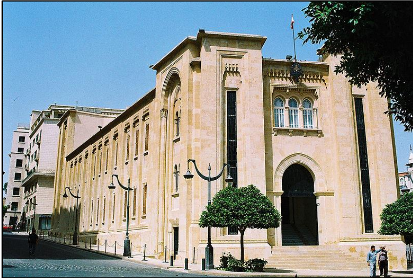
The Lebanese Parliament in Beirut.

Hezbollah has used Lebanon’s democracy to insert itself into the country’s government. Because Lebanon’s parliamentary system often requires opposing parties to join in political coalitions, Hezbollah has been a staple in Lebanese coalitions since 2008, giving the group influence over the stability, direction, and makeup of Lebanon’s government. In 2008, former CIA analyst Daniel L. Byman called Hezbollah “the most powerful single political movement in Lebanon.” 69