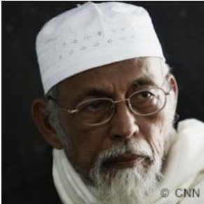
Abu Bakar Bashir

Founder and spiritual leader, alleged operational leader