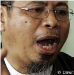
Mohamed Iqbal Abdurrahman (a.k.a. Abu Jibril)

Operational leader, head of regional shura, suspected al-Qaeda operations director for East Asia, now in extrajudicial detention at Guantanamo Bay