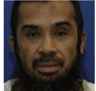
Riduan Isamuddin (a.k.a. Hambali)

Top recruiter, one of the masterminds behind the August 2003 attack on Marriott Hotel and September 2004 car bomb outside Australian Embassy in Jakarta, reportedly killed by Indonesian police in Java on September 17, 2009